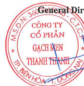
Tran Hung Luong