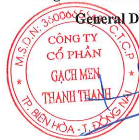
Tran Hung Luong