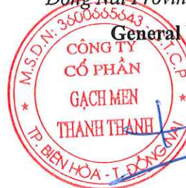
Tran Hung Luong